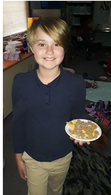
Taco and movie party!!