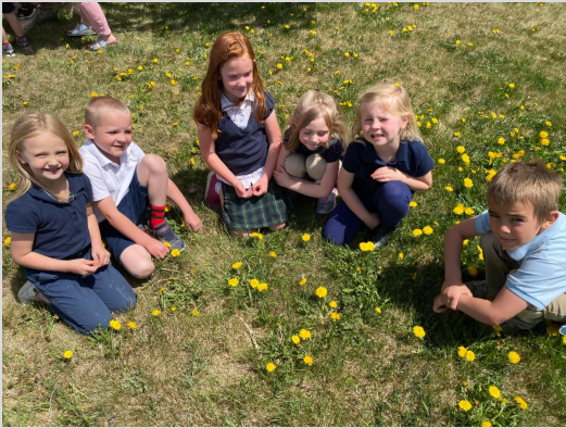
Mrs. C's class releasing their butterflies into the wild.