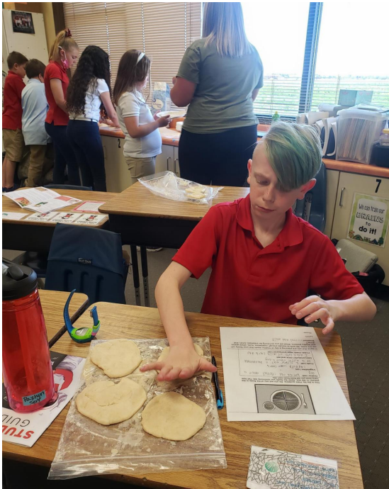
Fourth grade made some tortillas after learning about Idaho agriculture and wheat industry on the Idaho History Rendezvous.