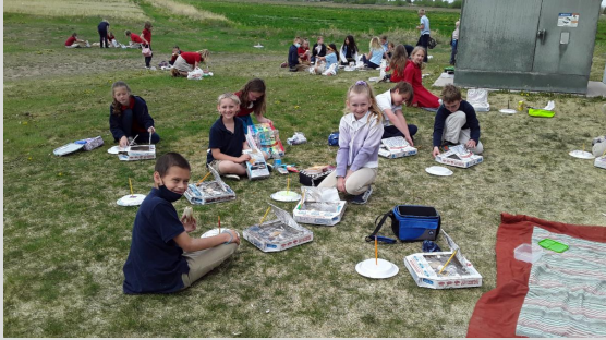
Third Grade Solar Oven Picnic!