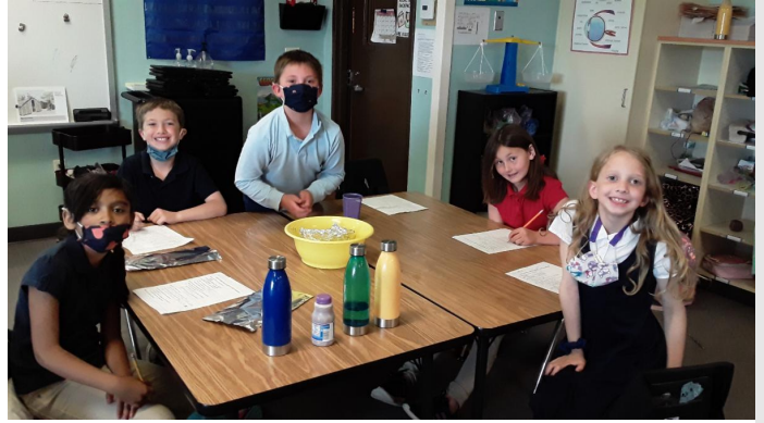
Third graders making their scientific method experiments.